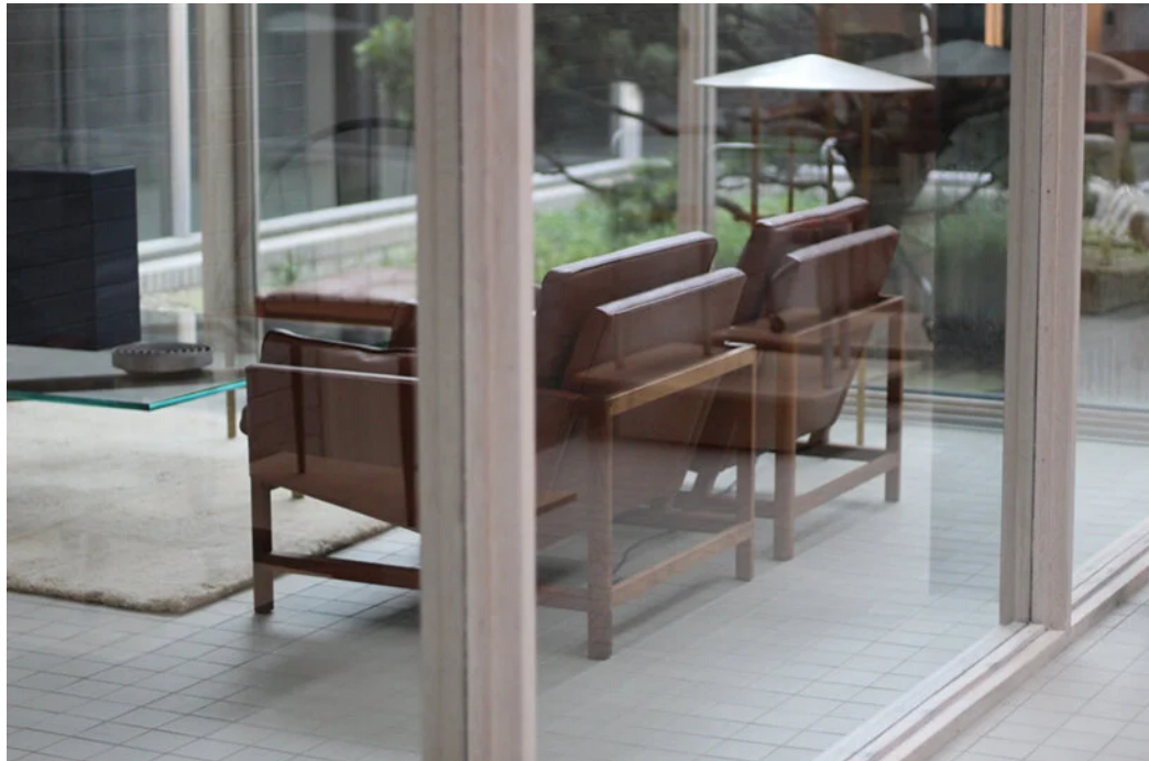
bassamfellows, wood frame lounge chairs, 2005 image © designboom