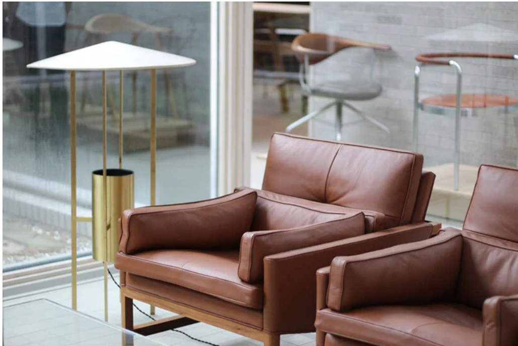
bassamfellows, wood frame lounge chairs, 2005 philip johnson and richard kelly, (four-legged) floor lamp 1954-67