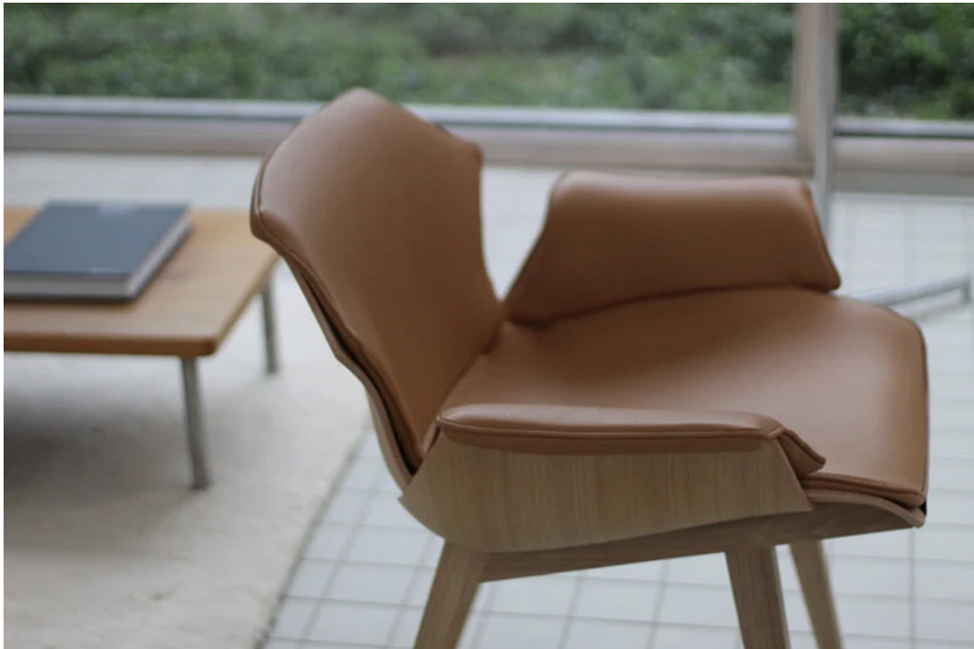
bassamfellows, petal lounge armchair, 2018