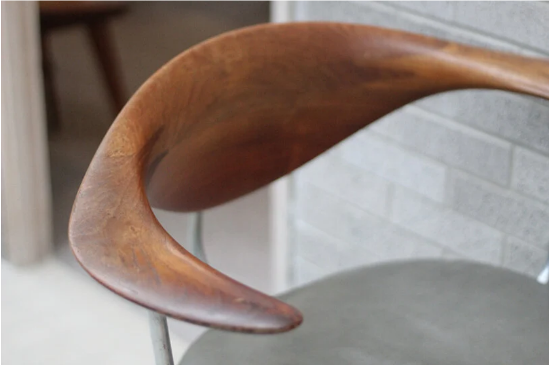
hans wegner, office chair, 1955-59