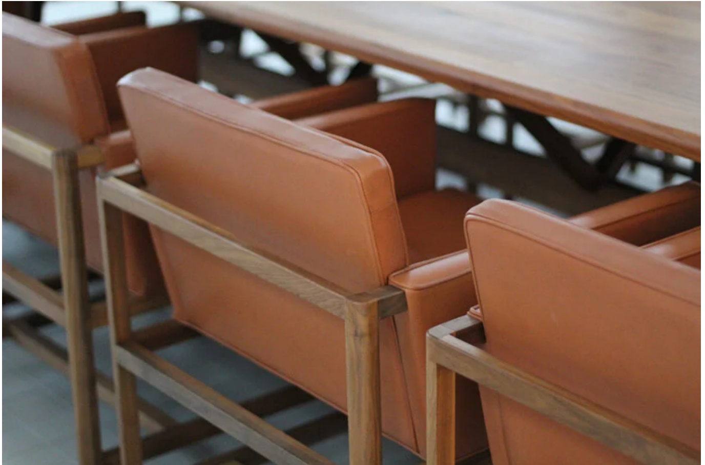
bassamfellows, wood frame armchairs , 2015

R & company curator james zemaitis comments on ‘modern in your life’ presented together with BassamFellows at its philip johnson-designed headquarters: ‘the summer exhibition at the schlumberger administration building presents a selection of design, which was included in moma’s good design exhibitions, within a johnson-designed interior, juxtaposed to paintings and sculpture by bauhaus-trained artists and the contemporary design of bassamfellows. connecticut played a significant role in the promotion of modernism and the international style in the united states, from the bauhaus interiors assembled by wadsworth director chick austin in his hartford residence in the early 1930s, to the postwar buildings of the ‘harvard five’ architects – which included johnson, breuer, and noyes — in and around new canaan.’