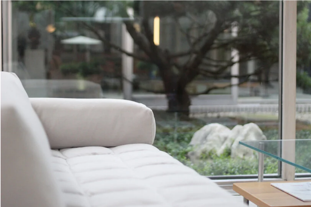
bassamfellows, asymmetric sofa, 2014