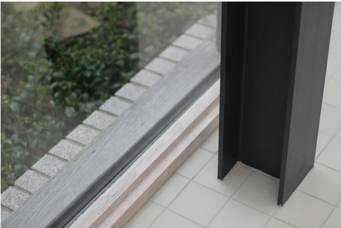
frame details image © designboom