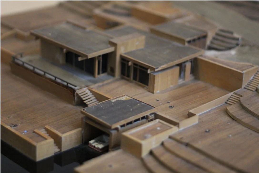
physical model image

exhibition: carve, curve, cane + modern in your life