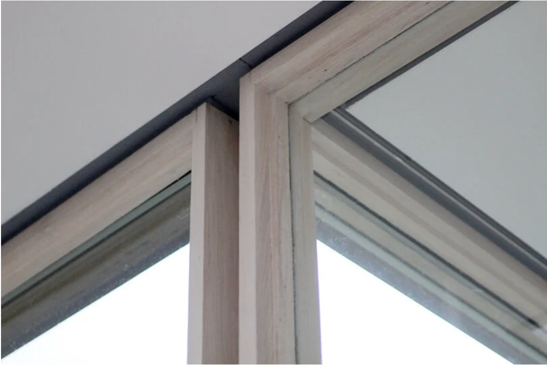
frame details image © designboom