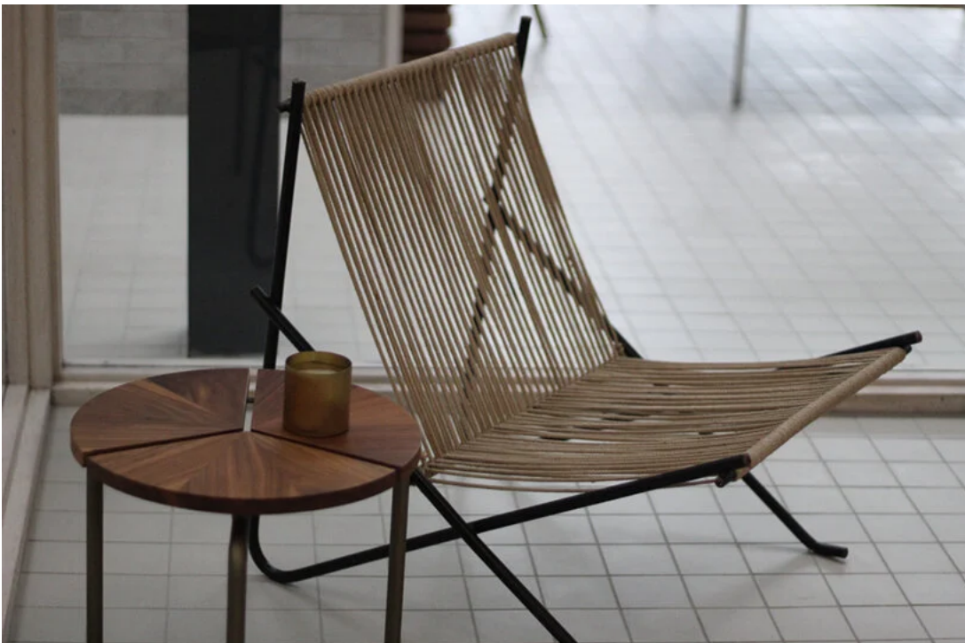
poul kjaerholm, holscher chair, 1952-53 bassamfellows, circular side table, 2002