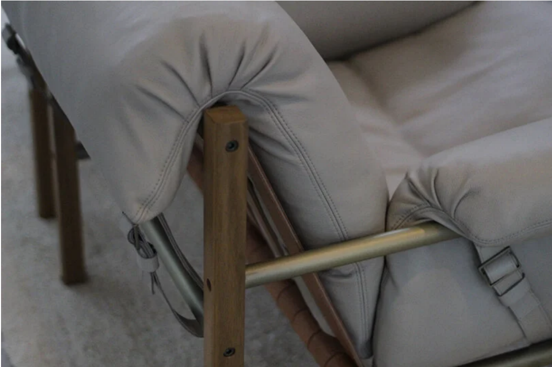
bassamfellows, sling club chairs, 2017 image © designboom