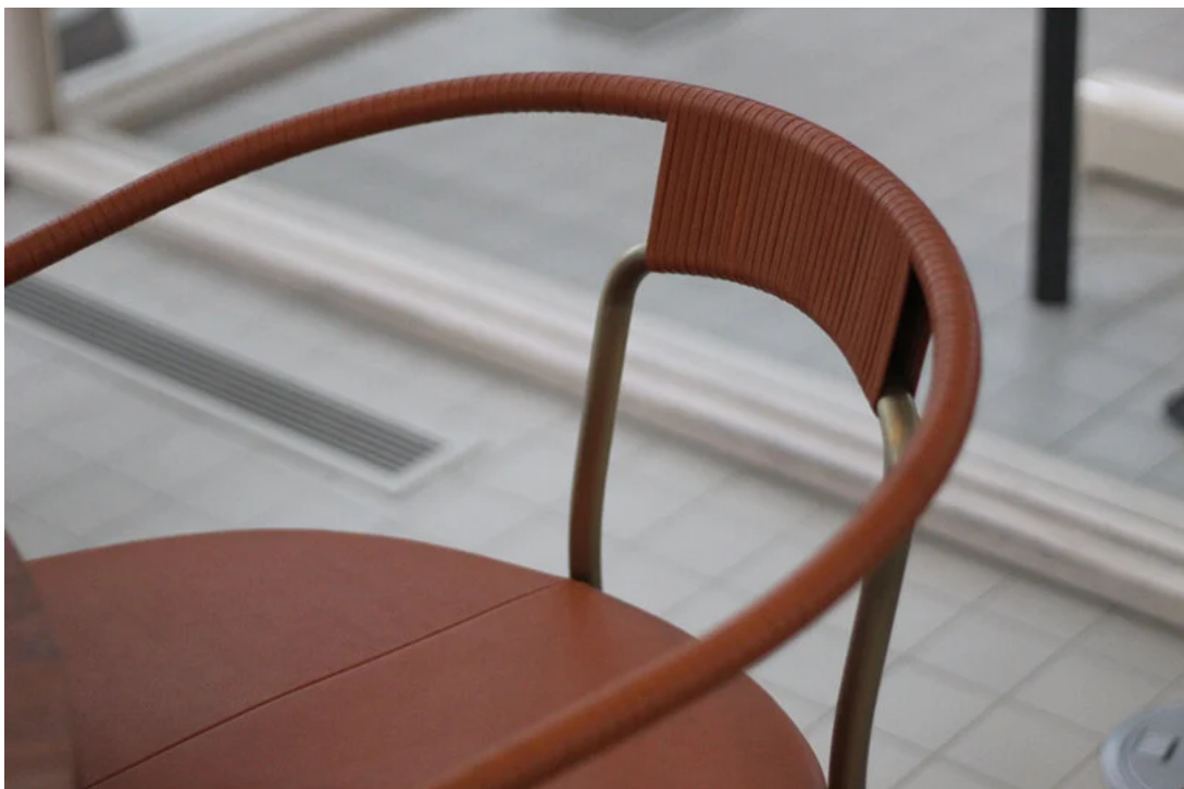
bassamfellows, geometric chair, 2017