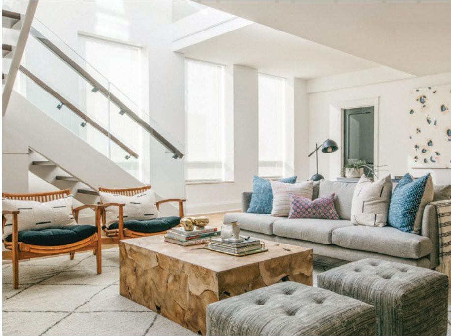
The lower-level living room includes a sofa by Article and a pair of black leather chairs by Cisco Brothers