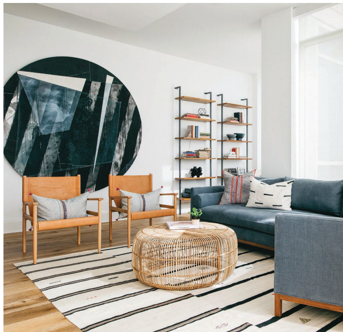
The upstairs seating area has one of the home’s many Turkish rugs. This one has meaningful symbols handstitched into the rug.